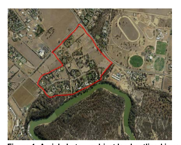
Figure 1: Aerial photo – subject land outlined in red outlined in red

The subject land has an area of 37.4 hectares. The reduction in minimum lot size to 3,000m2 could yield potentially 99 additional allotments in the Maiden Smith Drive precinct. It is expected that the actual lot yield will be considerably less, given the existing dwelling and settlement pattern, road pattern and infrastructure provision.