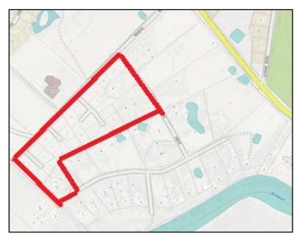
Figure 2: Cadastre – subject land

The Western Joint Regional Planning Panel (the Panel) was appointed as the Relevant Planning Authority (RPA) by the Minister for Planning on 17 March 2016. A conditional Gateway determination was made on 27 April 2016 in support of the proposal, which required community consultation and consultation with Council and OEH, RMS and the RFS.